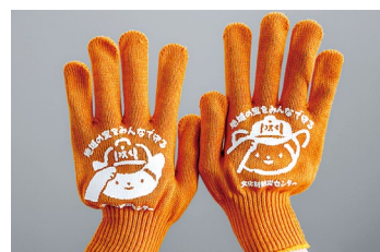
An example of a crowdfunding thank-you gift