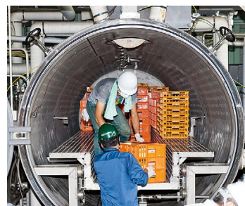
An operation to save cultural properties damaged in the Great East Japan Earthquake (Drying water-damaged documents using a vacuum freeze dryer)