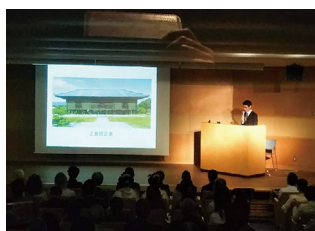
A special viewing event for supporting members (Nara National Museum)