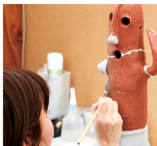
Conservation work is conducted on Tomb Sculptures (Haniwa): Dancing People