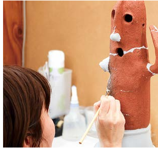
Conservation work is conducted on Tomb Sculptures ("Haniwa"): Dancing People

Your donations will be used to acquire, restore and research cultural properties, improve facilities, carry out educational activities, and save disaster-hit cultural heritage, for example.