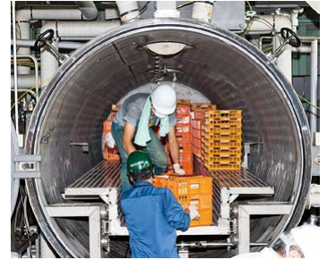
An operation to save cultural properties damaged in the Great East Japan Earthquake (Drying water-damaged documents using a vacuum freeze dryer)