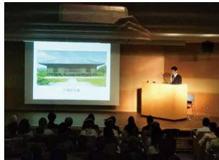
A special viewing event for supporting members (Nara National Museum)

* Benefits may differ according to institution and project.