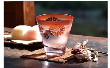
An example of a crowdfunding thank-you gift