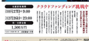
A crowdfunding project to repair the Hassōan Teahouse and its garden (Nara National Museum)