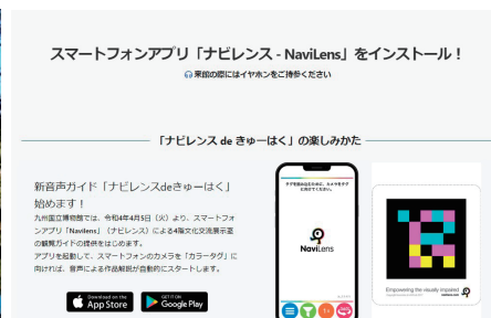
Introduction of a new audio guide system, NaviLens, at Kyushu National Museum