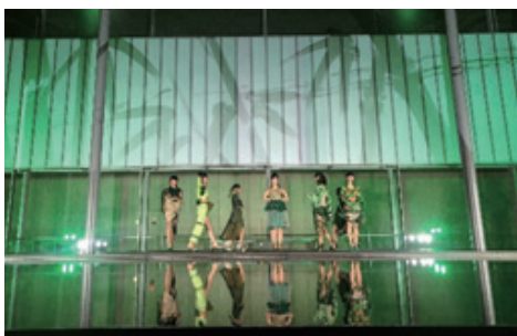
Detail and beauty fashion show + projection mapping performance, created by students at Kyoto Women's University (Kyoto National Museum)

To diversify visitor experiences, opening hours at the national museums are extended on Fridays and Saturdays, and various nighttime events are held. Efforts are being taken to facilitate understanding for foreign tourists, such as adding multilingual information labels and audio guides at exhibition galleries, namely in English, Chinese and Korean.