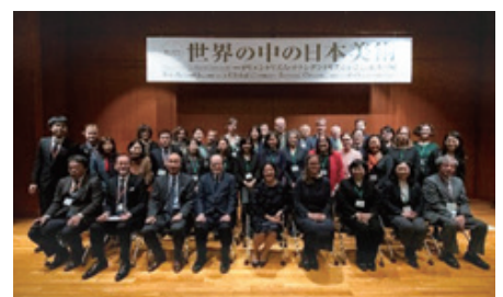
International Symposium: "The Arts of Japan in a Global Context: Beyond Orientalism and Occidentalism" (January 18, 2019; Tokyo National Museum)

When conditions allow, we loan items from our collections to museums in Japan and abroad so that they may be viewed more widely by both domestic and international audiences. We are also actively engaged in exchanging information and providing guidance and advice to other museums.