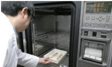
Testing insecticidal effect of humidity-controlled warm air treatment by studying the viable temperature for test insects (Tokyo National Research Institute for Cultural Properties)

We are engaged in undertaking fundamental and systematic research relating to cultural properties (including collaborative research and research-related exchange with other organizations, both in Japan and overseas) and also surveys and research that contribute to the preservation and effective utilization of cultural properties. The results achieved through these surveys and research have led to an increase in the amount of basic data available, facilitated the accumulation of academic knowledge, and provided the basic information needed to support the designation as cultural properties, while also contributing, at individual and collective levels, to the planning and establishment of cultural property preservation measures by national and local government bodies, as well as the evaluation of cultural properties.