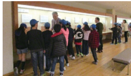
Nara City World Heritage classes (Nara National Museum)