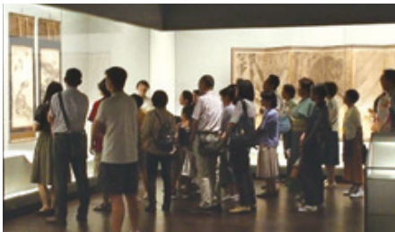
An Introduction to the Mysteries of Japanese Art Gallery Talk (Kyoto National Museum)

We also utilize the internet to disseminate information about cultural properties, and publicize our exhibitions and educational activities through the collection, publication, and display of various types of information.