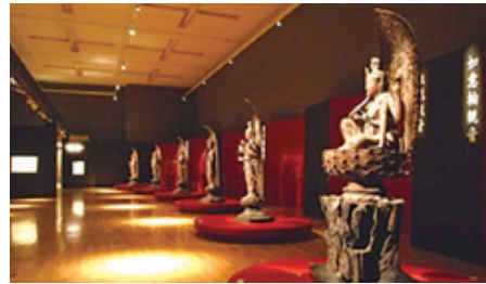
Tokyo National Museum: Special Exhibition: The Buddhist Sculptures of Daiho'onji: Kyoto Masterpieces by Kaikei and Jokei (October 2-December 9, 2018)