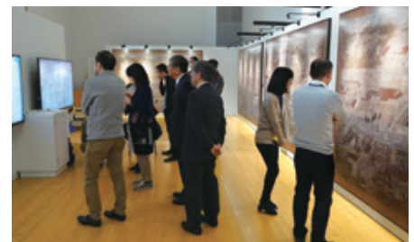
Thematic exhibition: Cultural Properties in 8K: The National Treasure "Illustrated Biography of Prince Shotoku" (November 27–December 25, 2018)