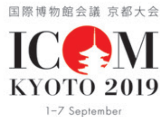
Logo for ICOM KYOTO 2019

The International Council of Museums (ICOM) is the world's largest non-governmental organization dedicated to promoting the advancement and development of the museum sector. In September 2019, the ICOM General Conference (which is held once every three years) will be held in Japan for the first time, in Kyoto. The participants at ICOM KYOTO 2019 will include many museum professionals from all over the world. Besides expert-panel discussions and meetings for all General Conference participants, there will also be various study tours and events for the general public. The NICH is assisting event organizers by dispatching personnel to the ICOM KYOTO 2019 Office to assist the ICOM KYOTO 2019 Organizing Committee, established under the Japanese Association of Museums.