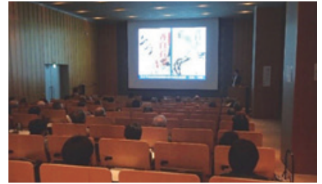
51st Open Lecture: "The Path from Form and to Form" (Tokyo National Research Institute for Cultural Properties)

We are working to promote the digitalization of information relating to cultural properties and expand related specialist archives, as well as organizing public lectures and international symposia, and expanding the content included on the websites of the individual facilities that make up the NICH, with the aim of furthering the collection, collation and preservation of information relating to cultural properties, and of ensuring that such outcomes are widely publicized and disseminated. We are also working to expand the displays of survey and research results held at the Nara Palace Site Museum, Exhibition Room of Fujiwara Imperial Site, and Asuka Historical Museum of the Nara National Research Institute for Cultural Properties, so as to provide the general public with a more in-depth understanding of related areas.