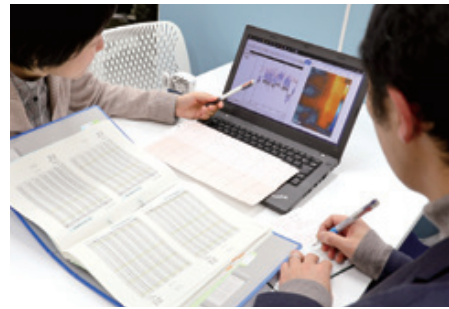
Providing consultation on conservation environments