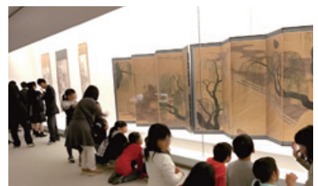
Collection item loan promotion project: National Treasure, Highlights of Japanese Aesthetics: Masterpieces from Tokyo National Museum (Oita Prefectural Art Museum, November 2–November 25, 2018)