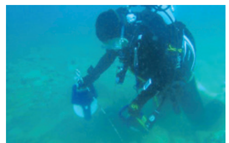
Undersea archeological exploration conducted at Kaminokuni-cho, Hokkaido (Kyushu National Museum)

The results obtained from our surveys and research are publicized using a variety of methods, including publications and the internet, thereby contributing to the transmission of cultural properties to the next generation and to the promotion of Japanese culture.