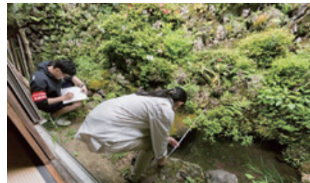
Survey undertaken at the Kitayama historic forestry landscape in the Nakagawa district of Kyoto (Nara National Research Institute for Cultural Properties)