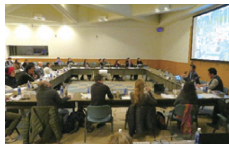
"Asia-Pacific Regional Workshop on Intangible Cultural Heritage and Natural Disasters" (International Research Centre for Intangible Cultural Heritage in the Asia-Pacific Region)

We promote the acquisition and analysis of information from abroad regarding cultural heritage, and also promote cooperative programs for the protection of this heritage. Additionally, we create human resources development and technology transfer programs for the conservation and restoration of cultural properties. These programs involve training and the dispatch of specialists. All of the aforementioned endeavors—which are pursued while utilizing the knowledge, technology, and experience—that Japan has for the protection of cultural heritage—are contributions of international importance. Moreover, through cooperation with researchers and other specialists in the Asia-Pacific region, we conduct research for the protection of intangible cultural heritage endangered by natural disasters and other threats, and promote protection of this heritage on an international scale. Through such activities for the protection of humanity's shared assets, we contribute to cultural exchange between countries and to mutual understanding.