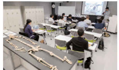
Course on conducting surveys of archeological sites located in low-lying wetlands—A class in progress (Nara National Research Institute for Cultural Properties)

While contributing to the enhancement of knowledge and techniques through the implementation of training tailored to the needs of local government authorities by making effective use of the results obtained in past surveys and research, we also undertake cultivation of core human resources that will play key roles in the preservation of Japan's cultural properties in the future, through collaborative education projects in conjunction with university graduate schools. After the Great East Japan Earthquake of 2011, we played a central role in activities conducted to rescue cultural properties at the request of the Agency for Cultural Affairs. Making effective use of this experience, we are also undertaking research projects and capacity building aimed at putting in place a nationwide system for coordination and collaboration so as to develop a network for safeguarding and rescuing cultural properties in the event of future large-scale disasters such as major earthquakes.