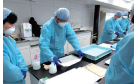
Training in the implementation of emergency treatments for water-damaged paper materials

In order to safeguard cultural properties from the kinds of disasters that have been occurring so frequently in recent years, we are strengthening collaboration with local government authorities and specialist organizations. When a disaster occurs, we cooperate with local government authorities and twenty-four specialist organizations to promptly collect information. We cooperate closely with the Agency of Cultural Affairs, dispatching experts and providing information with to minimize any damage caused by a disaster. We provide advice based on our research into emergency management and conservation methods for disaster-affected cultural properties. We are committed to building a stronger framework for disaster risk management for cultural properties. Our efforts include holding symposia and organizing training programs and other programs for cultural heritage officials at local government authorities along with activities to enhance awareness among the general public.