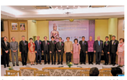
Special Exhibition on the Occasion of the 130th Anniversary of Thailand-Japan Diplomatic Relations: Japanese Art: Belief and Life (at the National Museum Bangkok; December 27, 2017- February 18, 2018)