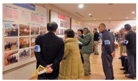
The Second Volunteer Festival (Nara National Museum)

Furthermore, we work with universities to provide professional training and support volunteer activities with the aim of further improving our educational programs. We also implement training programs for museum professionals, conservators, and others. We also utilize the internet to disseminate information about cultural properties, and publicize our exhibitions and educational activities through the collection, publication, and display of various types of information.