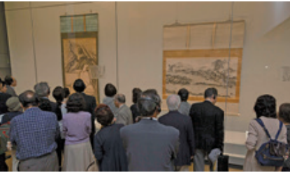
Kyoto National Museum: 120th Anniversary Commemorative Special Exhibition of National Treasures: Masterpieces of Japan (October 3-November 26, 2017)