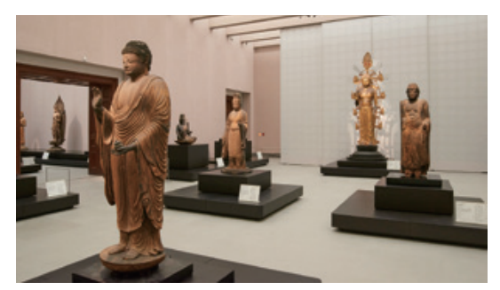
Nara Buddhist Sculpture Hall—Exhibition from the Permanent Collection: "Masterpieces of Buddhist Sculpture" (Nara National Museum)