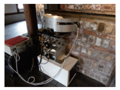
Investigation on brick cultural heritage using portable X-ray diffraction analyzer